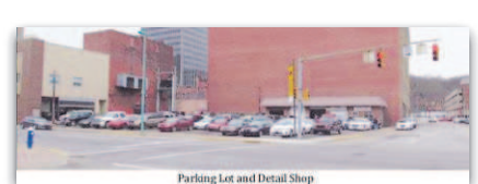
Parking Lot and Detail Shop

Established 14,500 square feet / one-third acre (+/-) paved level parcel with accessible frontage on Quarrier and Laidley Streets. Presently a detail shop and monthly parking business.