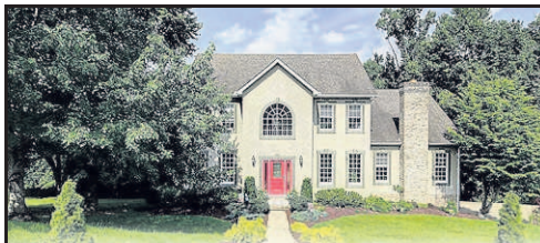
13 Hawkyard Lane, Charleston $399,900 2:00-4:00 PM

REDUCED! 5 Bedroom, 4 Bath traditional 2 story house located mins from downtown. 2 office areas, formal separate dining, large open living room and updated kitchen all on main floor. Full finished lower level with family room and additional bed and bath. Private deck & outside area great for entertaining! DIRECTIONS: Greenbrier street on the way to the airport, turn right on Oakridge Drive, go one mile approx and turn left on Hawkyard to 13 Hawkyard.