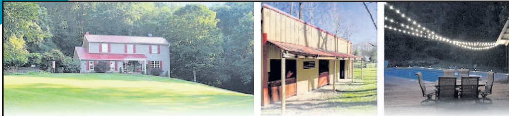
8 Thorough Bred Road, Scott Depot $412,000 2:00-4:00 PM

Warm, welcoming piece of heaven situated on 5 beautiful, private acres. A horse lovers dream with your own barn and fenced in pasture. This 5 bedroom home boasts a newly remodeled open concept kitchen and dining area, den with fireplace, 20x40 in-ground pool, hot tub, sun-filled screened in porch, 2 car attached garage as well as a 4 car detached garage + RV carport. This gem is one-of-a-kind, and truly a must-see to capture all of its charm!