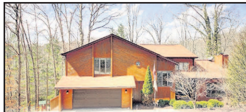
1421 Stonehenge Road, Charleston $499,000 2:00-4:00 PM

Custom built contemporary with large updated dine-in kitchen. Open family room with fireplace and access to deck. Formal separate dining room. 5 bedrooms, 3 full and 1 half bath. Master suite with own private deck. Full finished lower level featuring large rec room. Whole house generator and heated driveway! DIRECTIONS: Loudon Heights Rd. to Hampton to Right into Stonehenge