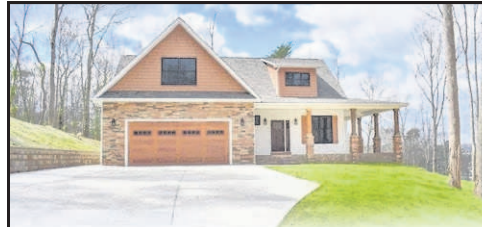
248 Mayberry Drive, Winfield $429,900 1:00-3:00 PM

Beautiful one owner custom home in the desirable Courtyard Est. w/ 4BR/2.5BA 2 car garage! 1st floor offers a cozy LR w/FP open to the kitchen w/breakfast nook. Sliding barn door gives privacy to office. Spacious 1st floor owner's suite has a walk-in closet, private bath w/soaking tub, walk-in tile shower. 2nd floor offers 3BR/1BA. DIRECTIONS: From State Route 817, turn onto Valley St. towards WV State Police barracks & go straight. Behind Putnam County Courthouse. House at end of Mayberry.