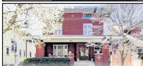
1585 Quarrier Street, Charleston $325,000 2:00-4:00 PM

Stunning historical East End home offering 5 bedroom, 3.5 bath with many updates. Conveniently located close to the Capital and Downtown Charleston. Move in Ready so your can start enjoying that front porch living that the East End Community is so famous for.