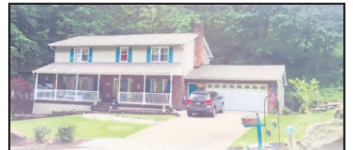
1590 Alexandria Place, Charleston $335,000 2:00-4:00 PM

Heart of South Hills. Beautiful hardwood floors ample room sizes, updated kitchen and bathroom. Covered porch, deck, and hot tub. Full basement with storage. Move-in ready at the end of a cul-de-sac.