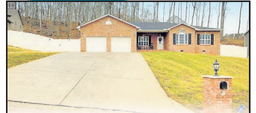
62 Russell Drive, Winfield $339,900 2:00-4:00 PM

Better than new! Brick home features open floor plan with split bedrooms, large open family room with gas log fireplace, gleaming hardwoods, completely fenced backyard, 12 x 10 mini barn, energy efficient window shutters, minutes from I-64.