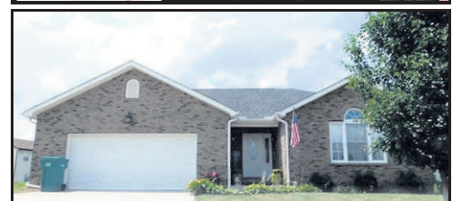
24 Durham Court, Hurricane $231,000 2:00-4:00 PM

"Like new" - open floor plan - beautiful hardwoods - solid wood doors - stainless appliances - 3 bedrooms - 2 full baths - cathedral ceilings - screened in porch - 2 car garage - level lot