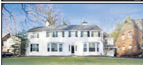
510 Linden Road, Charleston $440,000 2:00-4:00 PM

Charming front of the hill house! 4 bedroom, 4 full and 2 half baths. Large rooms, large closets and extra storage throughout! Media/rec room, office and first floor family room. Updated kitchen with all new appliances. Street to Street lot with fenced backyard and covered patio. DIRECTIONS: South Side Bridge to Bridge Road, Right on Bridge Road to Right on Myrtle Road, Right on Linden, home on the right.