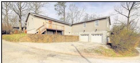
5145 Saulton Drive, Cross Lanes $159,900 2:00-4:00 PM

Very desirable open&airy floor plan! 4 bedrooms, 3 baths, new flooring, large master, master bath w/heated jacuzzi tub & tiled stand up shower. Nicely updated kitchen w/concrete counters, tile back splash & newer appliances. 15x30 above ground pool, nice covered deck, over sized 2 car attached garage. DIRECTIONS: I-64 Cross Lanes exit, right on Goff Mountain Road, go approximately 2 miles, turn right on Waycross, left on Greywood, right on Saulton, house on left.